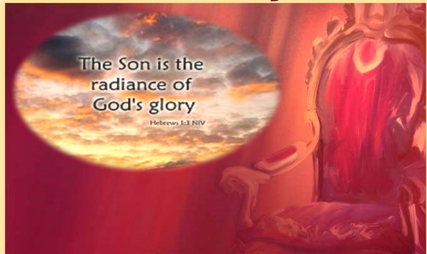
Hebrews 1: 1-3