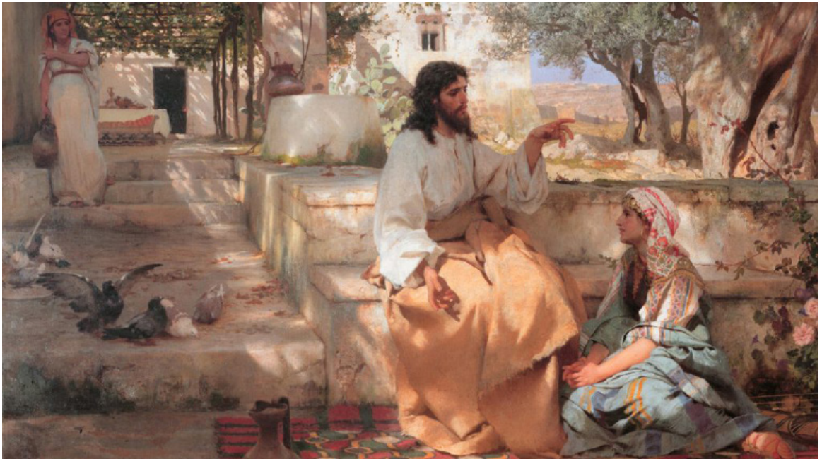
"Christ with Martha and Mary," Henryk Siemiradzki